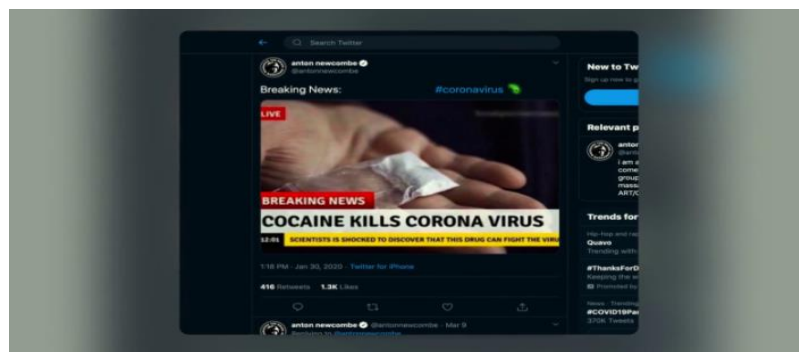
Picture 1. Fake news about cocaine can kill covid-19 (The Social Dilemma,1:03:38-1:03:41)

The picture above depicts fake news that propagated on Twitter regarding one of the illicit substances, cocaine, to eradicate the Covid-19 virus. When the epidemic began to spread throughout the world, this information was extensively disseminated on social media. This news was purposefully created so that many social media users would read it to learn the truth, to generate a large number of clicks on the news, since the more clicks or readers on a piece of information that is shared, the more interaction they will have. Thus they will reap numerous benefits from the fake news they create.