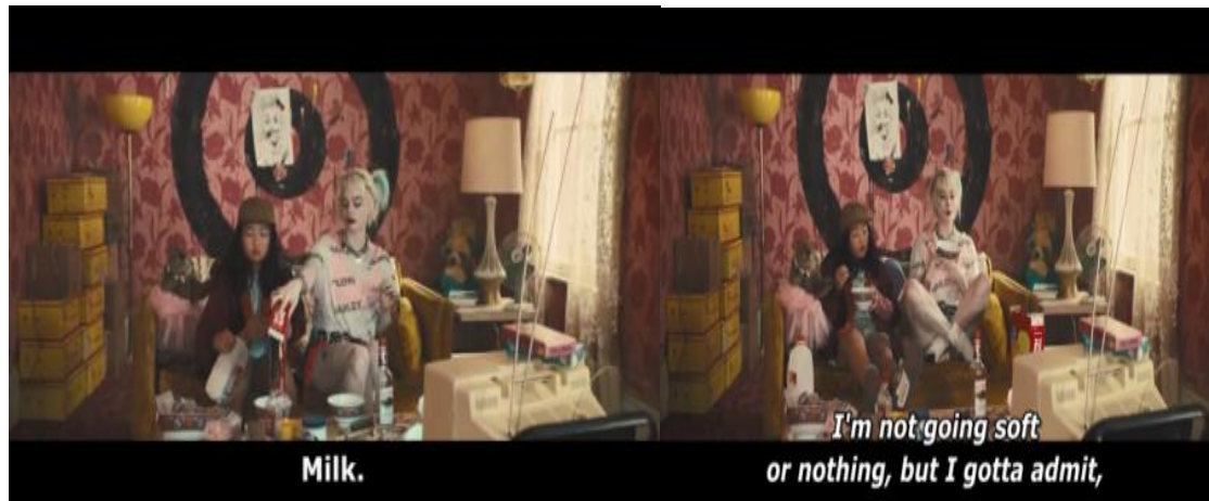
Picture 3. Harley Brings Cassandra Cain to her House

herself as an independent person, and she can release herself from the Joker's shadow. Harley has shown her femininity as Harley is more open to people around her. She has returned to her nature as a woman. As Naomi Wolf (1993: 202) stated that women know that the choices made by women can affect the lives of those around them and can change the world.