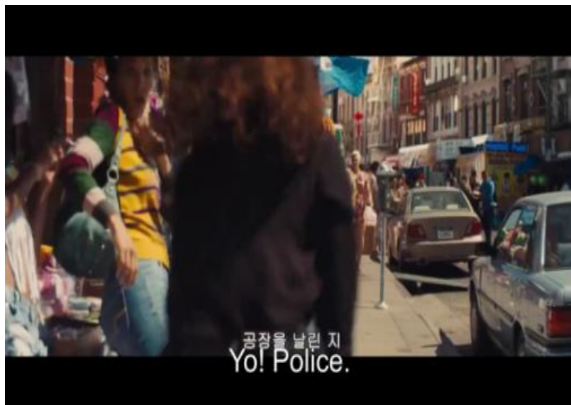
Picture 5. Harley is Being Chased by Reene Montoya

one scene in the movie, Harley must survive the pursuit of her enemies and must struggle to solve her problems to live in peace and safety. However, as seen in the movie, all the problems she faces can be overcome by her. Because Harley here holds fast to her stance in fighting amid an unsafe surrounding environment. Harley is also here to show the representation of women who have a strong feminist ideology in fighting for themselves as women. The scene that represents women with strong characters in the power of feminism shown by Harley is in the duration of 00:14:09-00:15:40