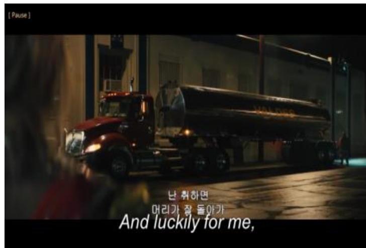
Picture 1. Harley Blows up a Chemical Factory in a Truck

In the movie Birds of Prey , the character of woman as the main character reverses the situation about the nature and character of weak women to be strong and stand firm in the movie. Harley Quinn's character in the movie shows the opposite trait that is more masculine than feminism. Every woman must possess this solid and opinionated character; the strength referred to here is not giving up easily under any circumstances and solving all problems on her own. Every woman has the right to what is on her. For example, the scene shown in the movie is Harley's appearance, which was previously more feminine when she was with the joker. She completely changed her appearance to be more accessible and funkier. A scene that shows the independence of Harley Quinn in the movie can be seen in the following scene at the duration of 00:06:20-00:07:43