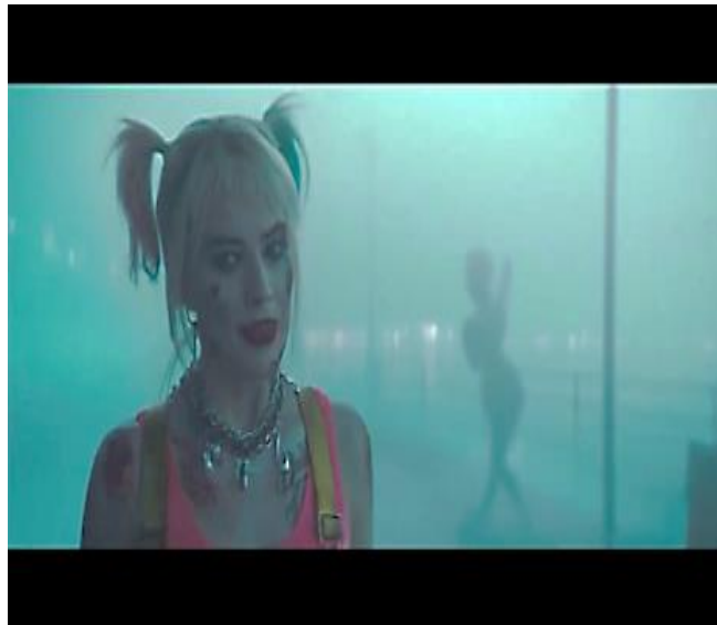
Picture 2. Harley Surrounds Roman Sionis

Harley : “Here’s the thing, Roman baby.” Harley : “You’re protection is based on the fact that people are scared of you. Just like they’re scared to Mr. J.” Harley : “But I’m the one they should be scared of.” Harley : “Not you, and not Mr. J.” Harley : “Cause, I’m Harley fucking Quinn.”